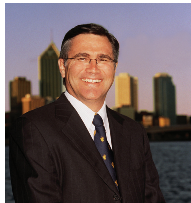
Dr Geoff Gallop, Premier of Western Australia